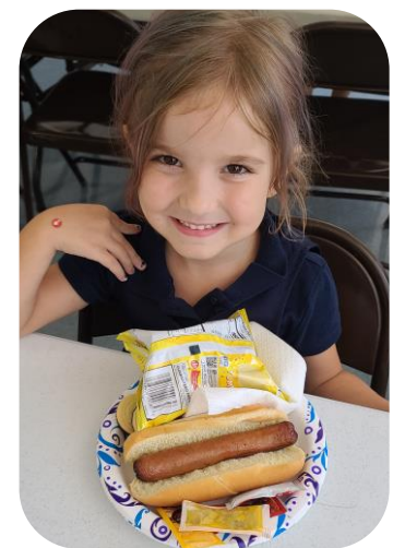
Hot Dog Day