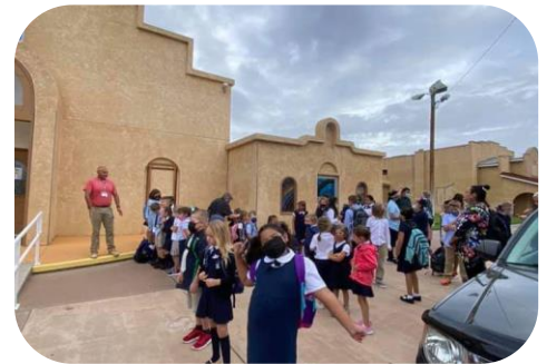
Mass at ICC