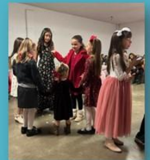
Valentine's Day Dance