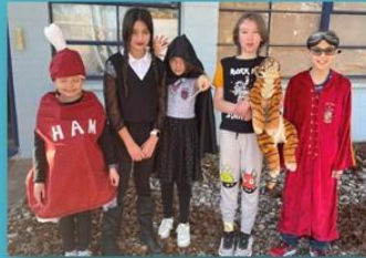
Spirit Week: Community Heroes & Book or Movie Characters