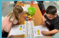
Fill the Hexagon